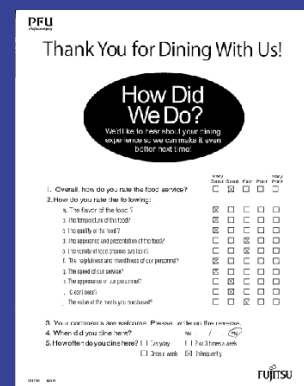
PaperStream IP Clean Up Applied