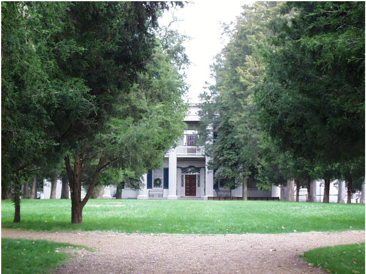
The Hermitage – Taken by Austin Valentine September 2015