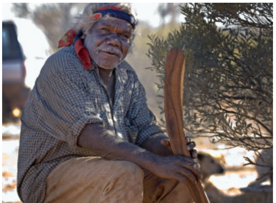
Alyawarr man with alyayl (boomerang) made at Amperlatwaty walk-off camp at Honeymoon Bore, August 2009.

Until these demands are met, we are asking for the help of trade unions and any other organisations to establish and maintain our new camp. 24