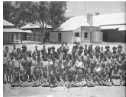
Aboriginal children at a government institution near Alice Springs, 1934.