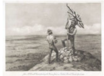
John McDouall Stuart planting the Union Jack on Central Mount Stuart, 1860.

2009 Following campaigns by Aboriginal leaders and human rights organisations, the RDA is reinstated, however the intervention continues to discriminate against Aboriginal Peoples.