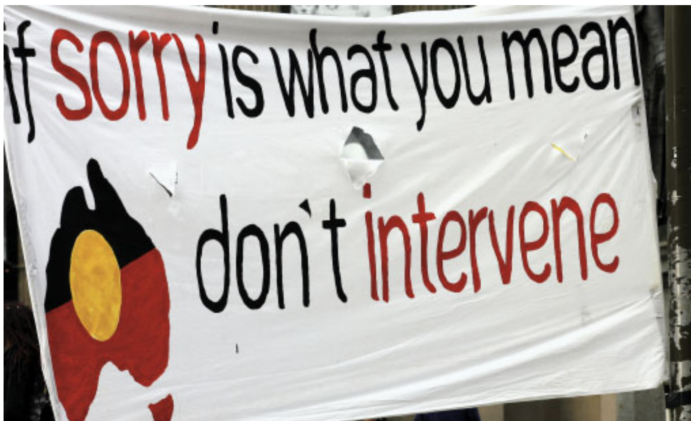
A banner at a rally in Melbourne calling for an end to the Northern Territory intervention in June 2008. Aboriginal leaders have called for urgent and decisive action by the Federal government to improve living conditions for Australia's Aboriginal communities.

The Government has not made a case in linking the removal of land from Aboriginal ownership and getting rid of the permit system with protecting children from those who abuse them. What is becoming increasingly clear is that the Howard Government has used the emotive issue of child abuse to justify this intervention in the only Australian jurisdiction in which it can implement its radical indigenous policy agenda. 3