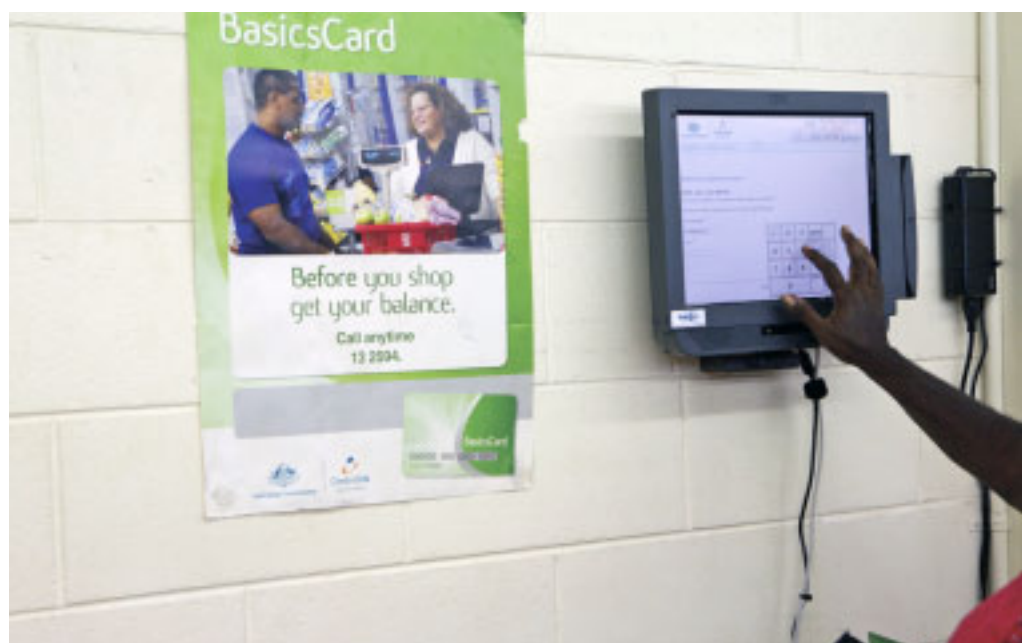
Community member at Muckaty, NT checking BasicsCard balance.