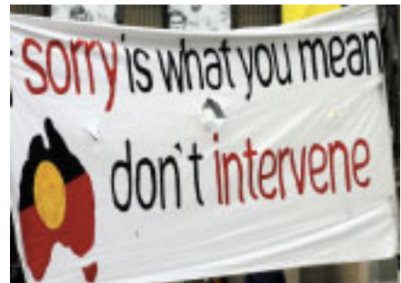
Banner at a rally calling for an end to the NT intervention, 2008.